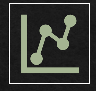
To improve the communication of unexpected radiologic findings